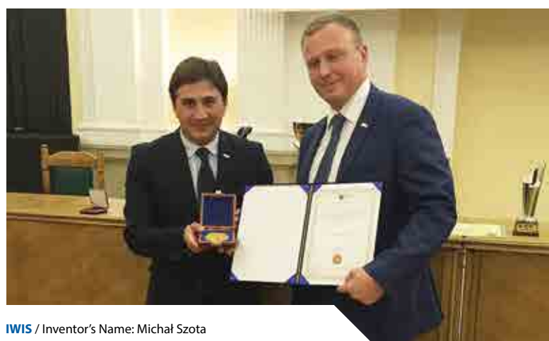
IWIS / Inventor's Name: Michal Szota