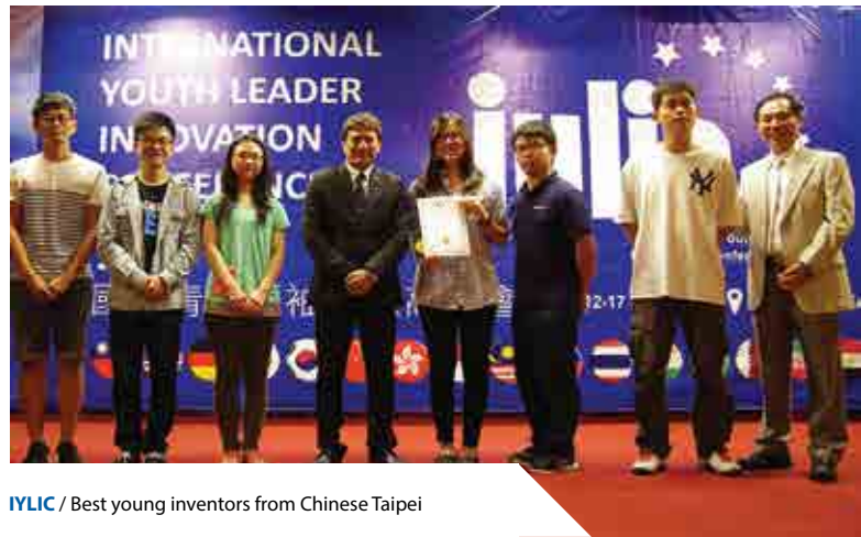
IYLIC / Best young inventors from Chinese Taipei