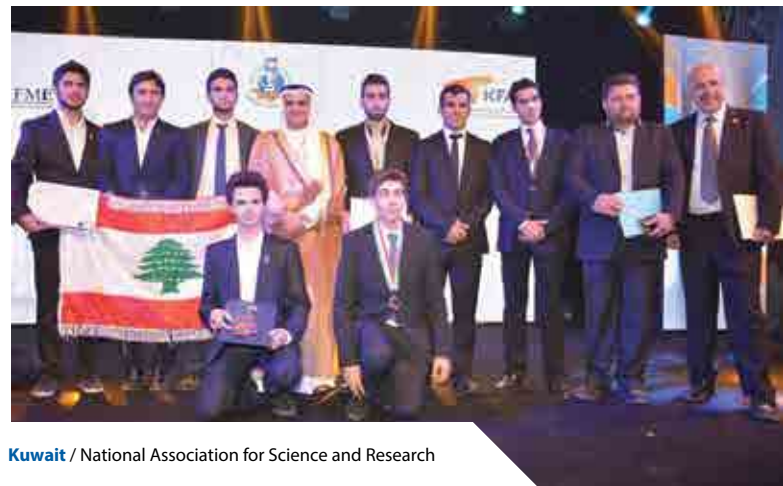
Kuwait / National Association for Science and Research