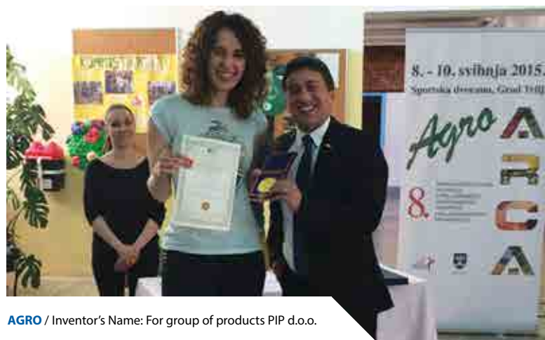
AGRO / Inventor's Name: For group of products PIP d.o.o.