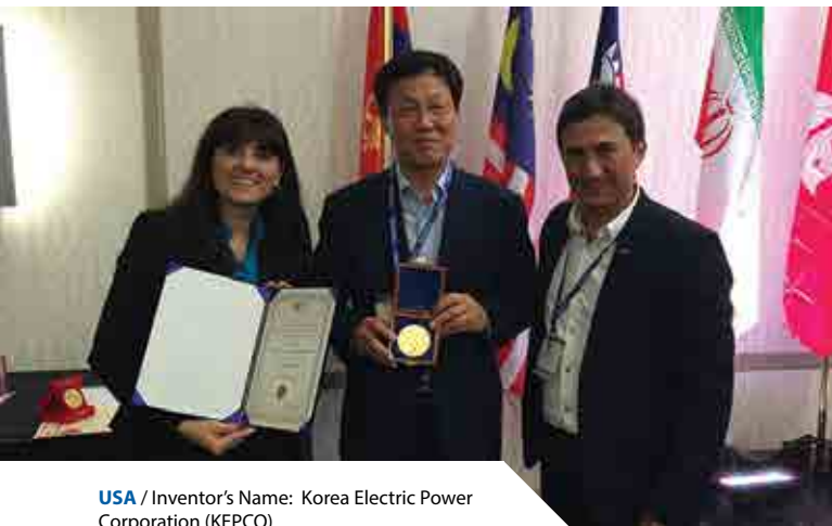
USA / Inventor's Name: Korea Electric Power Corporation (KEPCO)