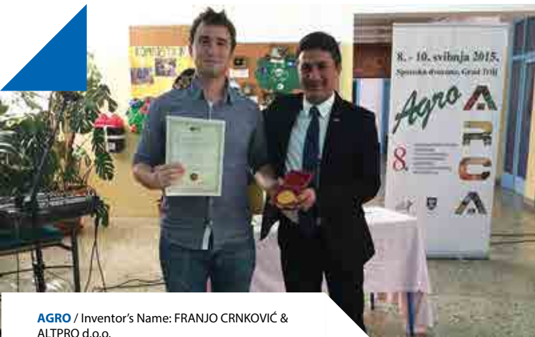
AGRO / Inventor's Name: FRANJO CRNKOVIĆ & ALTPRO d.o.o.