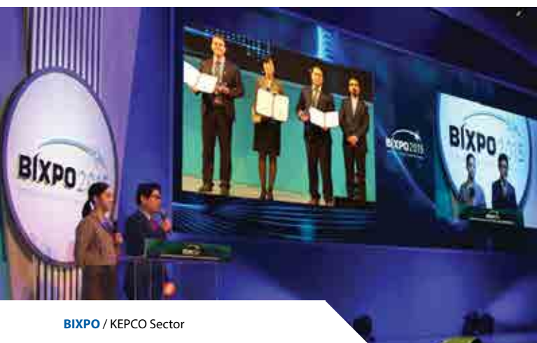
BIXPO / KEPCO Sector