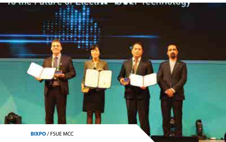
BIXPO / FSUE MCC