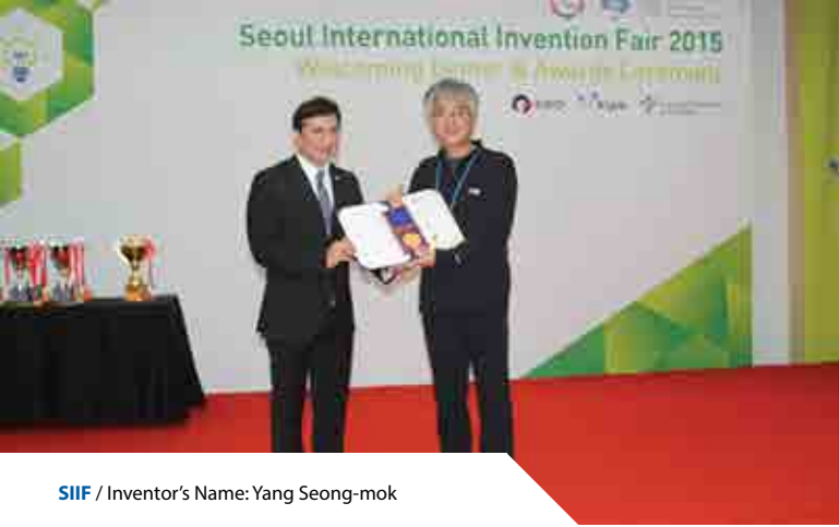
SIIF / Inventor's Name: Yang Seong-mok