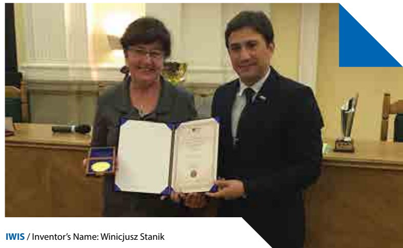
IWIS / Inventor's Name: Winićjusz Stanik