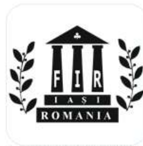
Romanian Inventors Forum