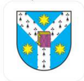
Alexandru Ioan Cuza University of Iasi